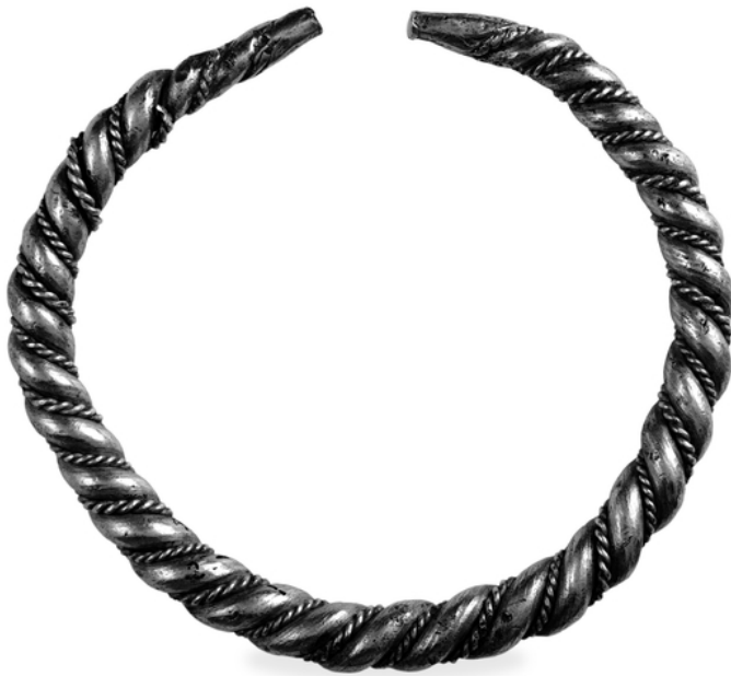
Gold arm-ring Viking 10th century AD